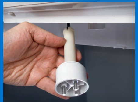
Snap-fit water probe