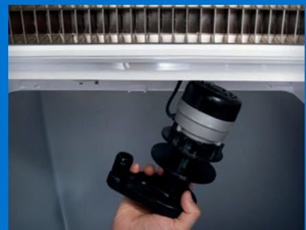
Snap-fit water pump