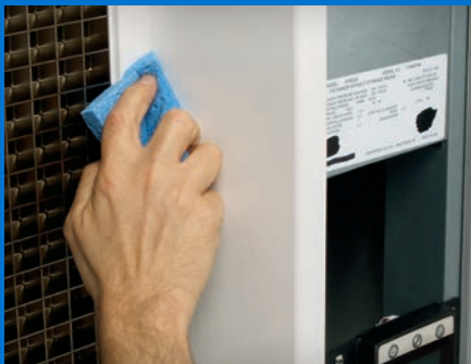
Rounded foodzone corners