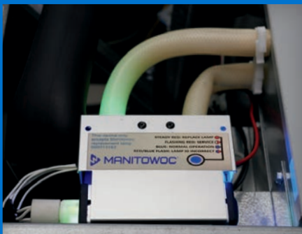
LuminIce II Growth Inhibitor accessory