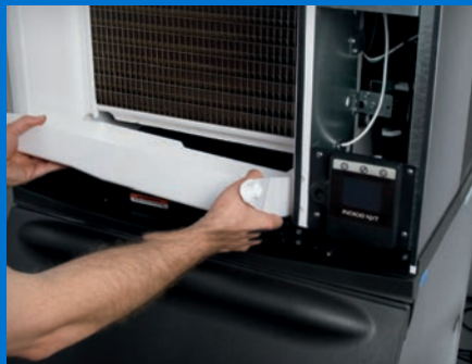
Removable water trough