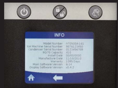
One touch machine info